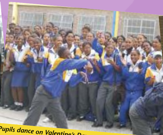
Pupils dance on Valentine's Day