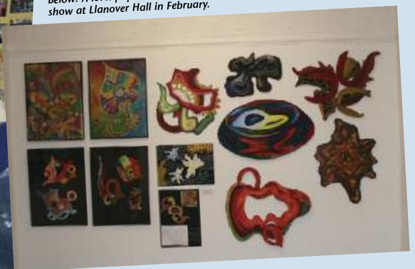
Left: A level Art and Textiles Exhibition in the new exhibition space in the Upper school gym.