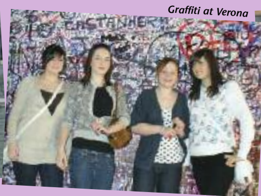
Graffiti at Verona