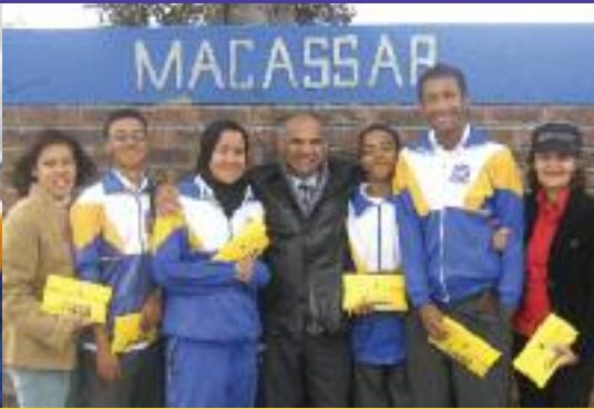
Macassar sends its pupils to Wales