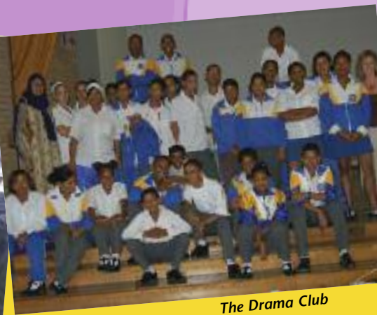
The Drama Club