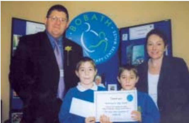
Bobath Cymru are presented with a cheque for £500

In the Spring term, cheques were presented to representatives from Bobath Cymru, The British Heart Foundation and Velindre Hospital after various fundraising activities by the pupils. The Children in Need final total was £5,000 (which was more money raised than any other school in Wales!). The Special Childrens Party at the end of the Autumn term was also a great success and a credit to the organisational skills of the sixth form team.